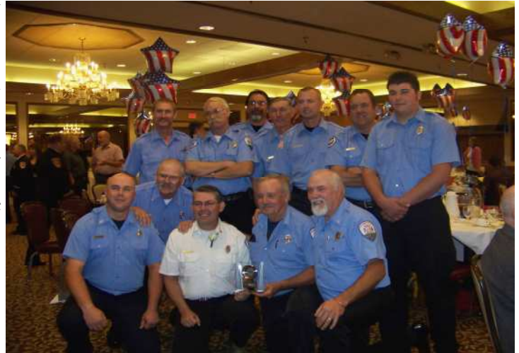
The heroes of the Auberry Volunteer Fire Department, being honored at TIP's Salute to On-Scene Heroes.

As recognized outstanding first responders receiving the Salute to On-Scene Heroes award, the men and women of Auberry Volunteer Fire Department serve their community with pride, dedication and compassion, and are relentless in their efforts to serve their community and support TIP. Their motto is "Neighbors Helping Neighbors," and that is how they treat anyone who is in need of their services. They are tireless in their training and are always in support of TIP in any way that they can.